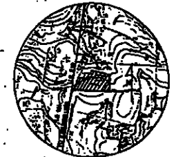
SITE LOCATION SCALE: 1" = 2000'

THE MUNICIPAL AUTHORITY OF THE BOROUGH OF EBENSBURG