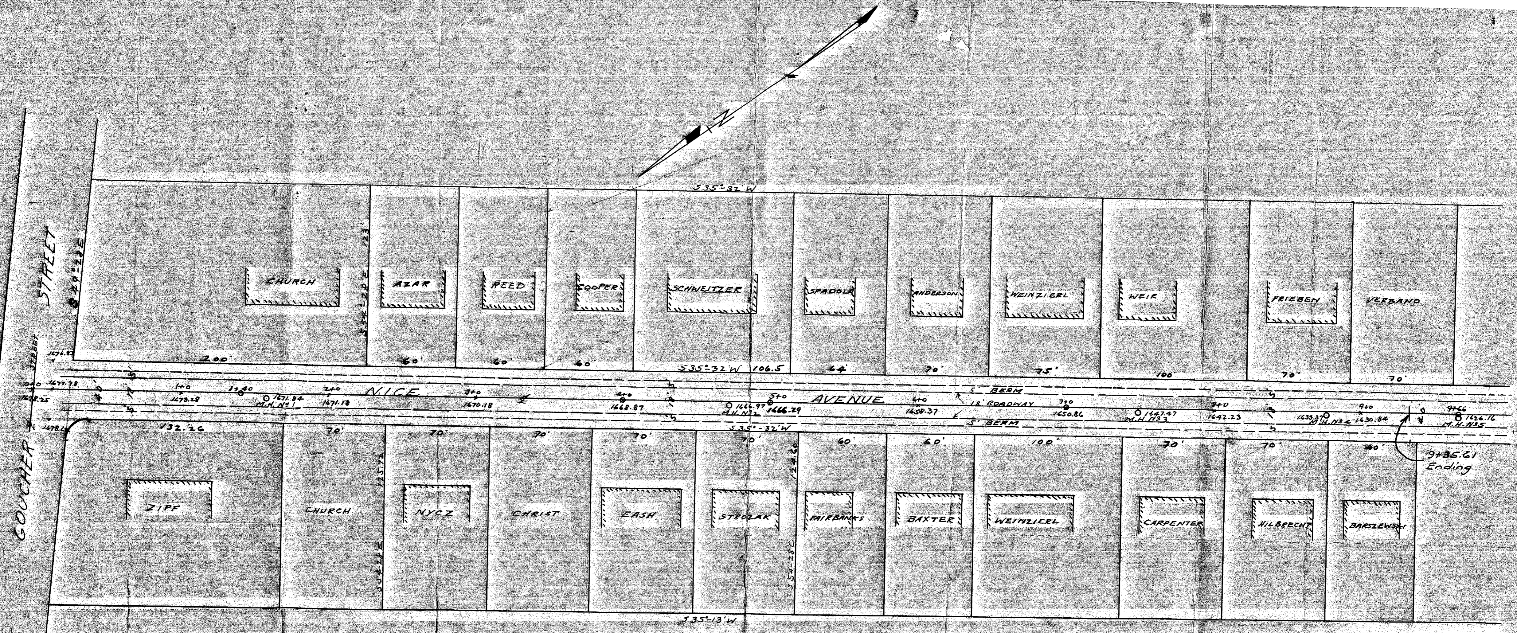
NICE AVENUE - PLAN SCALE - 1" = 40' FETTERMAN ENG. CO. MAY 11, 1959