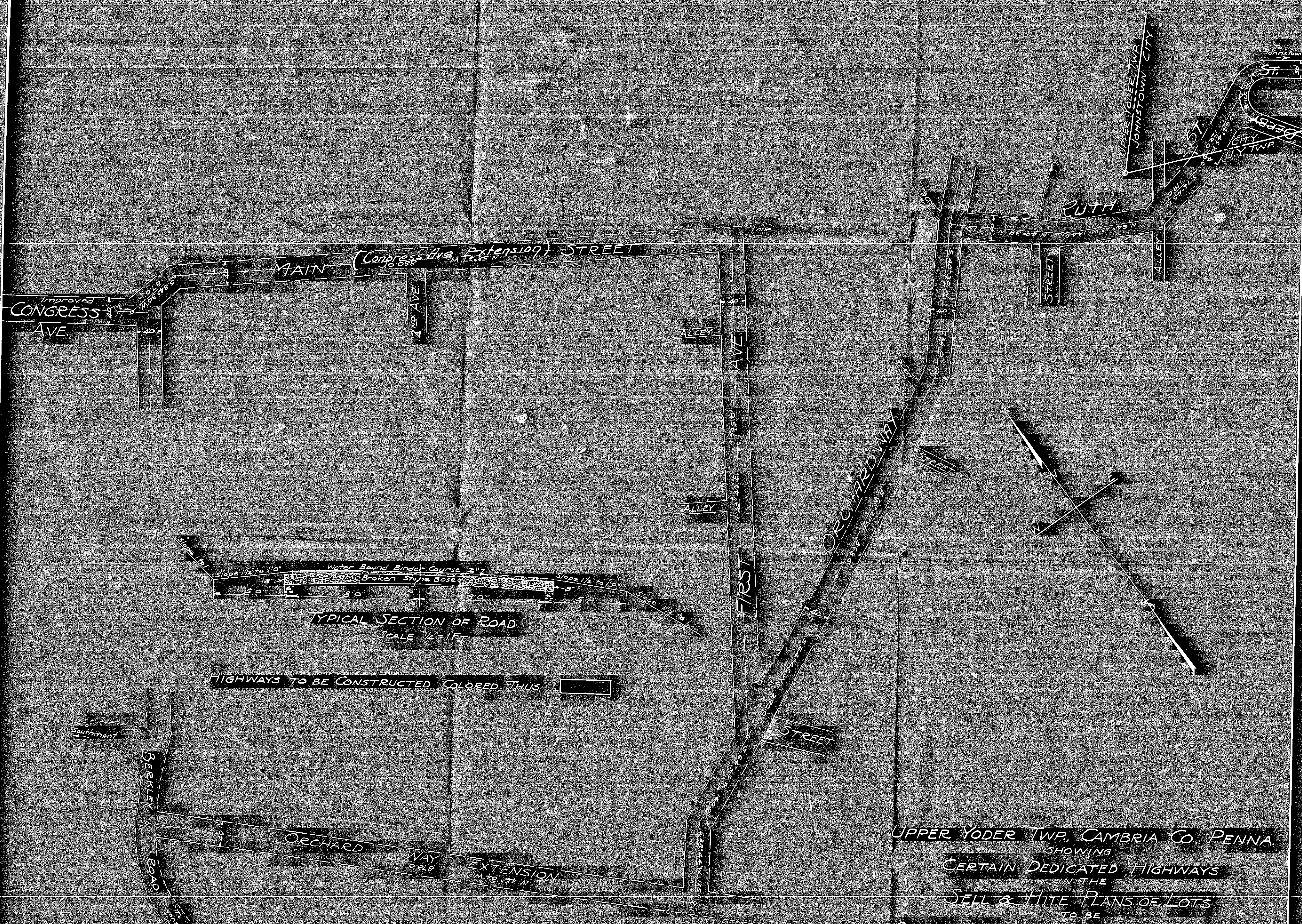
TYPICAL SECTION OF ROAD SCALE 1/4" = 1 FT