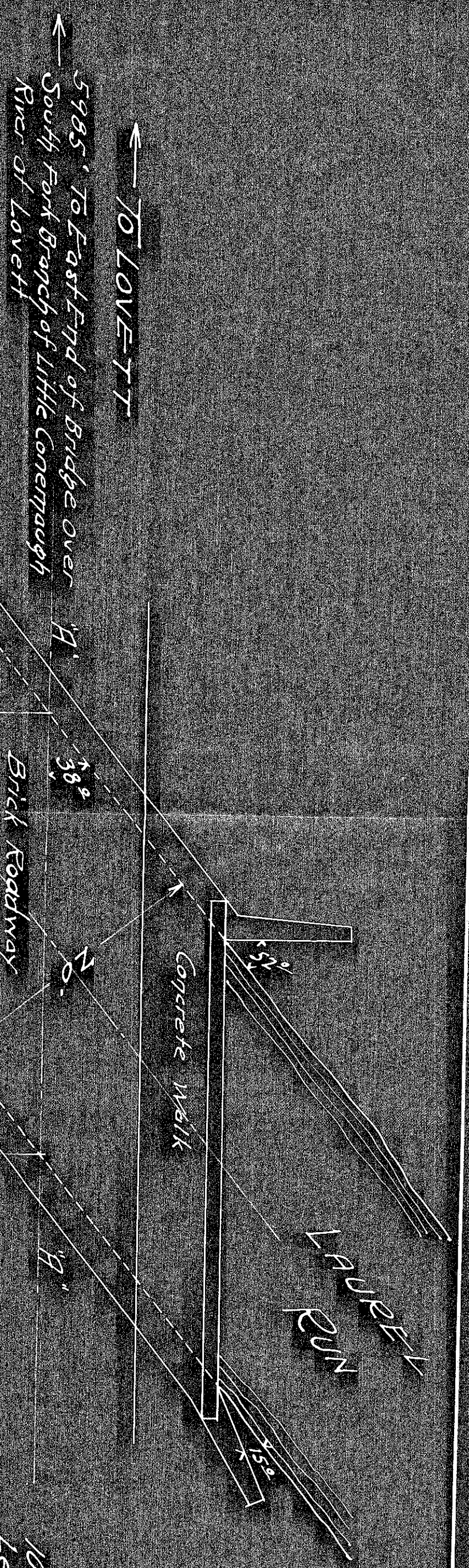
PLAN Scale 1/8" = 1 foot