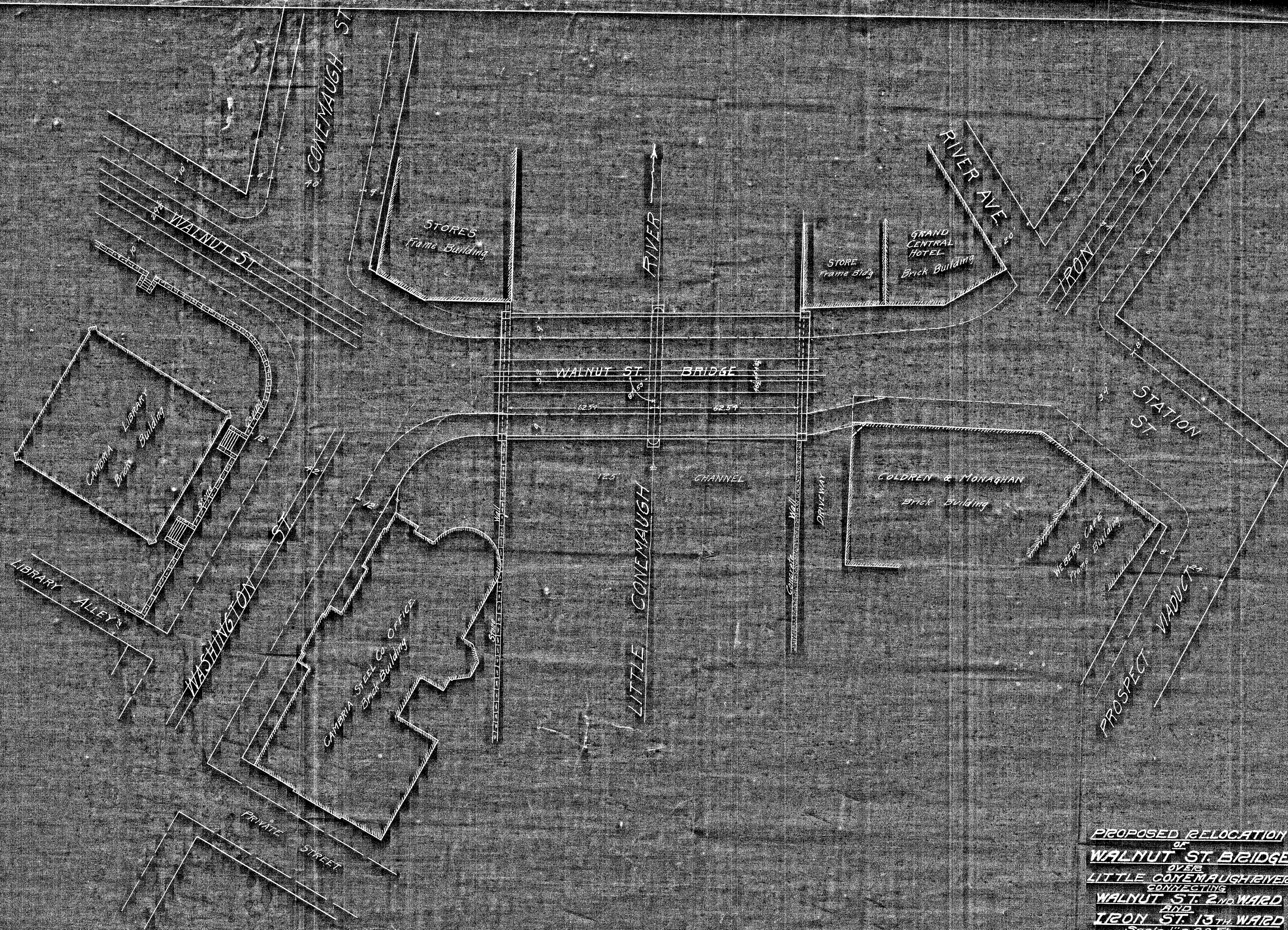
PROPOSED RELOCATION OF WALNUT ST. BRIDGE OVER LITTLE CONEMAUGH RIVER CONNECTING WALNUT ST. 2 ND WARD AND IRON ST. 13 TH WARD Scale 1" = 20 Ft.